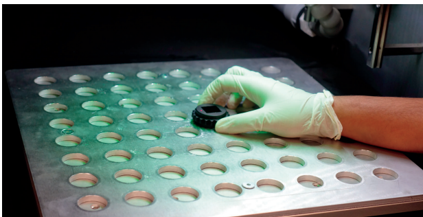
Lowell Engineers Setting Up the Laser Marker Machine

WEST BOYLSTON, MA - Lowell Corporation is offering one of the greatest innovations in marking technology in recent years. With its new Keyence 3-Axis Hybrid Laser Marker machine, Lowell Corporation is able to take markings and identifications to the next level. The implementation of a Laser Marker machine into Lowell's production process allows the company to offer a variety of different marking types as an add on service for its clients.